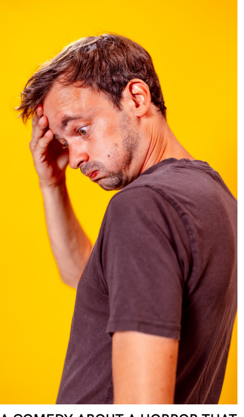
A COMEDY ABOUT A HORROR THAT EACH OF US MAY ENCOUNTER